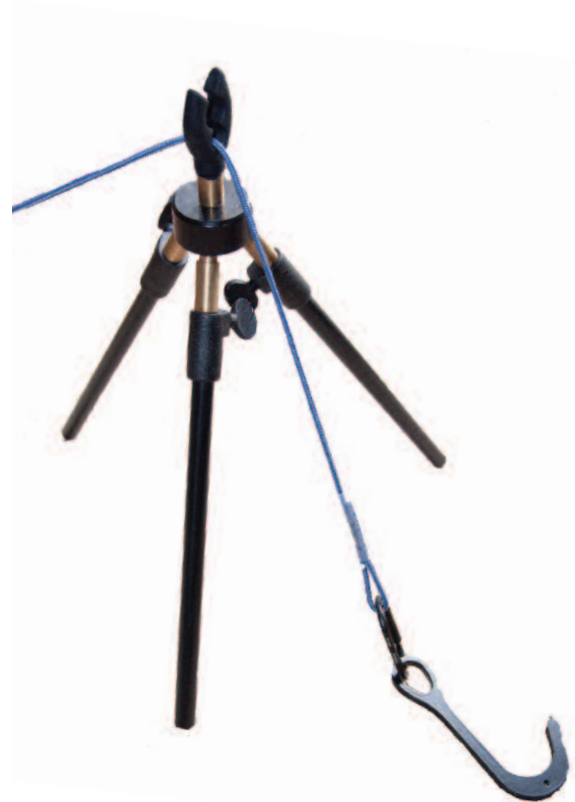
Fulcrum Assembled with 120mm Hook

EOD UK RESERVE THE RIGHT TO REPLACE COMPONENTS WITHOUT NOTICE AS PART OF OUR CONTINUOUS PROGRAMME OF RESEARCH & DEVELOPMENT